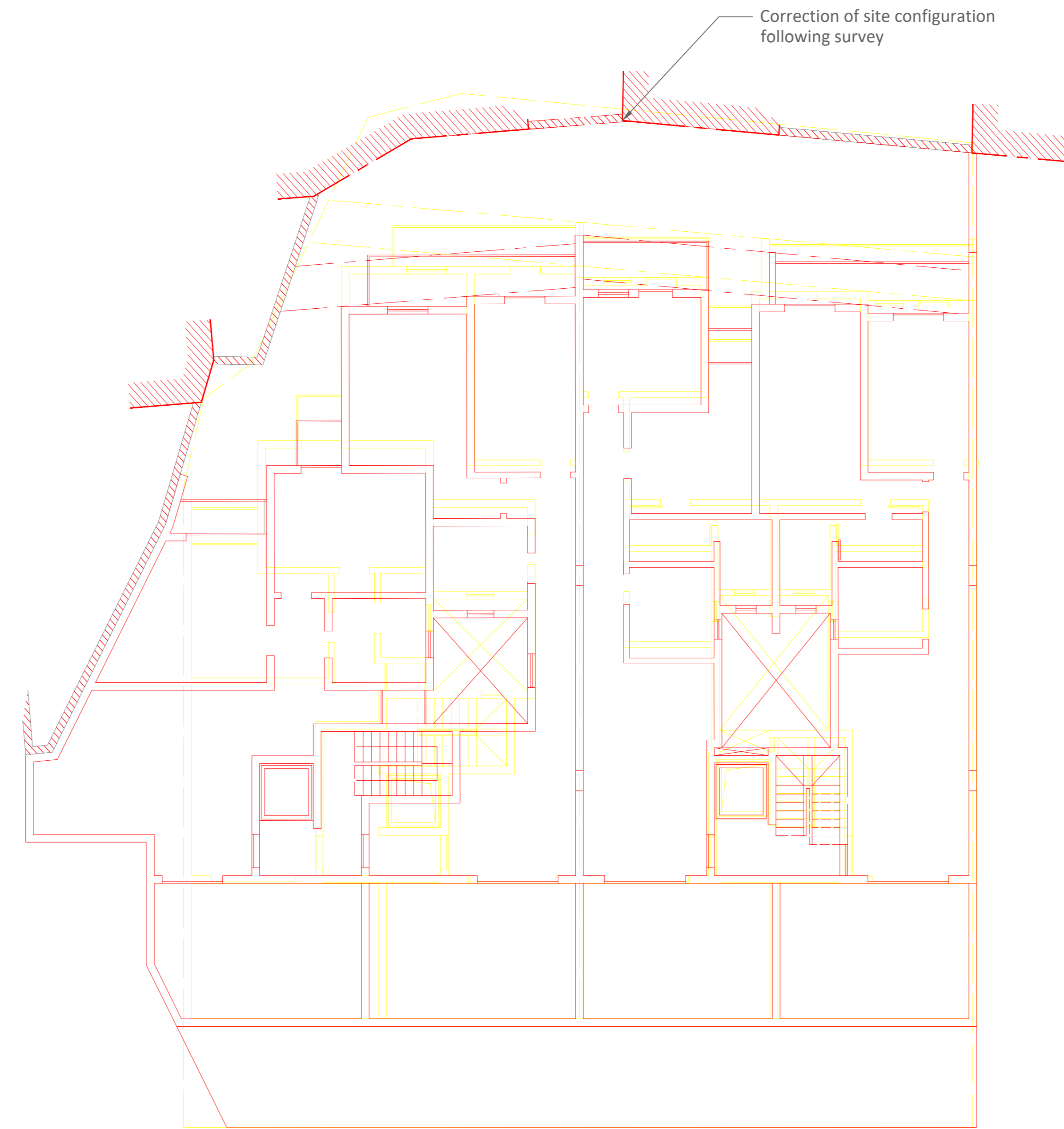
4th RECEDING FLOOR PLAN - LEVEL 4 AS APPROVED / AS AMENDED Scale: 1:100.