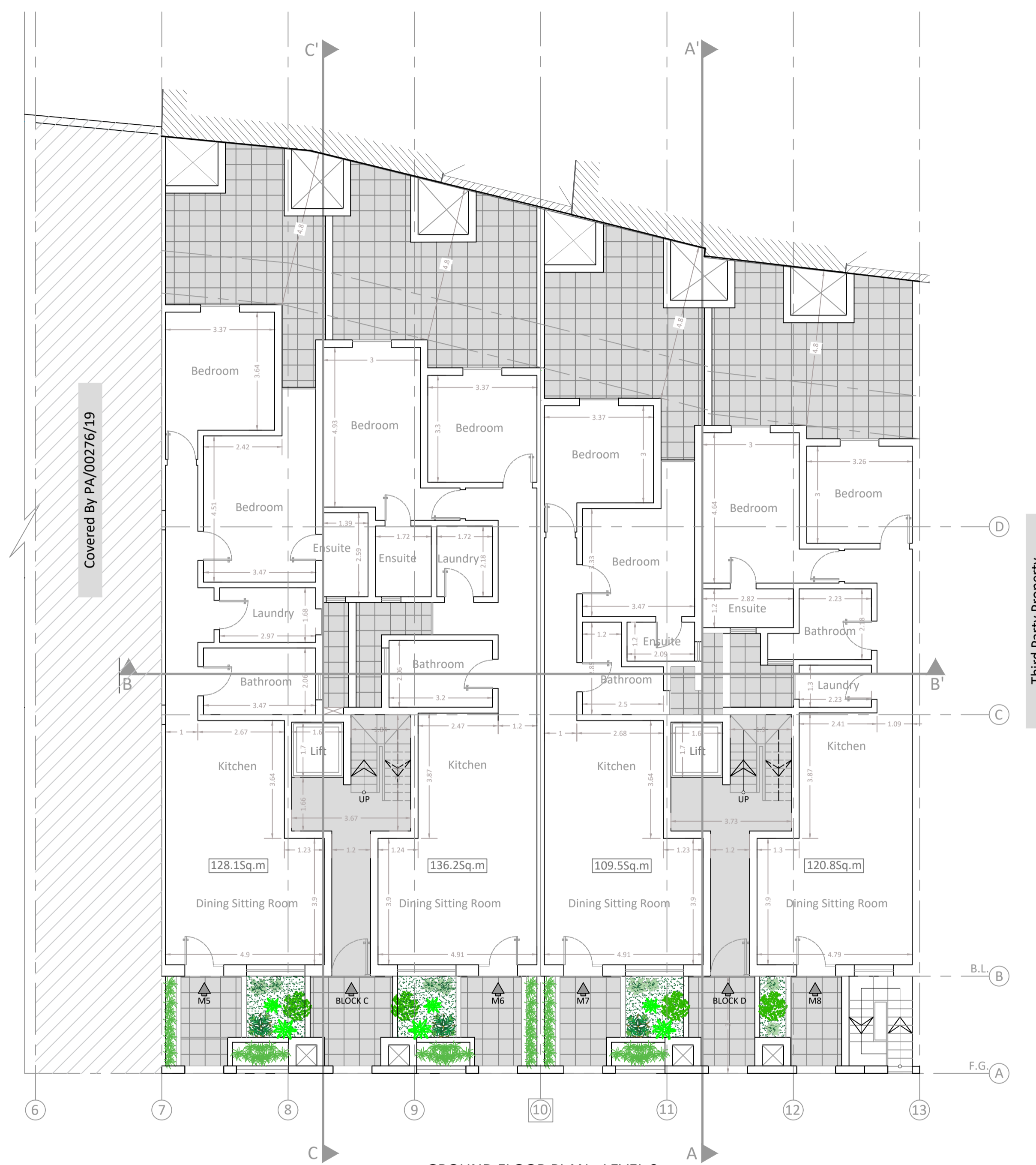
GROUND FLOOR PLAN - LEVEL 0 AS PROPOSED Scale: 1:100.