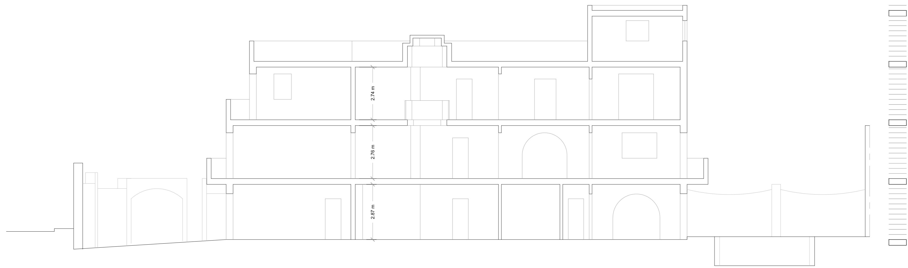
EXISTING SECTION SCALE 1:100