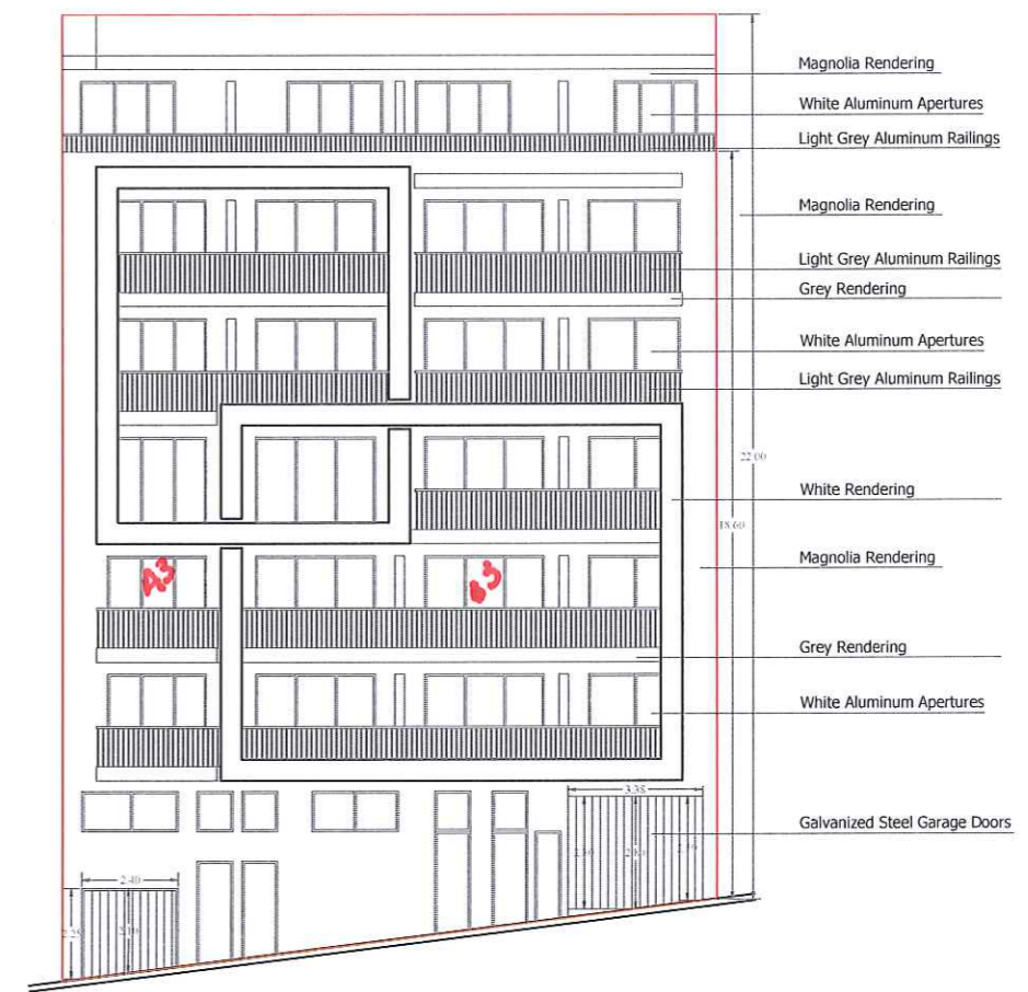
Proposed Elevation Scale 1:100