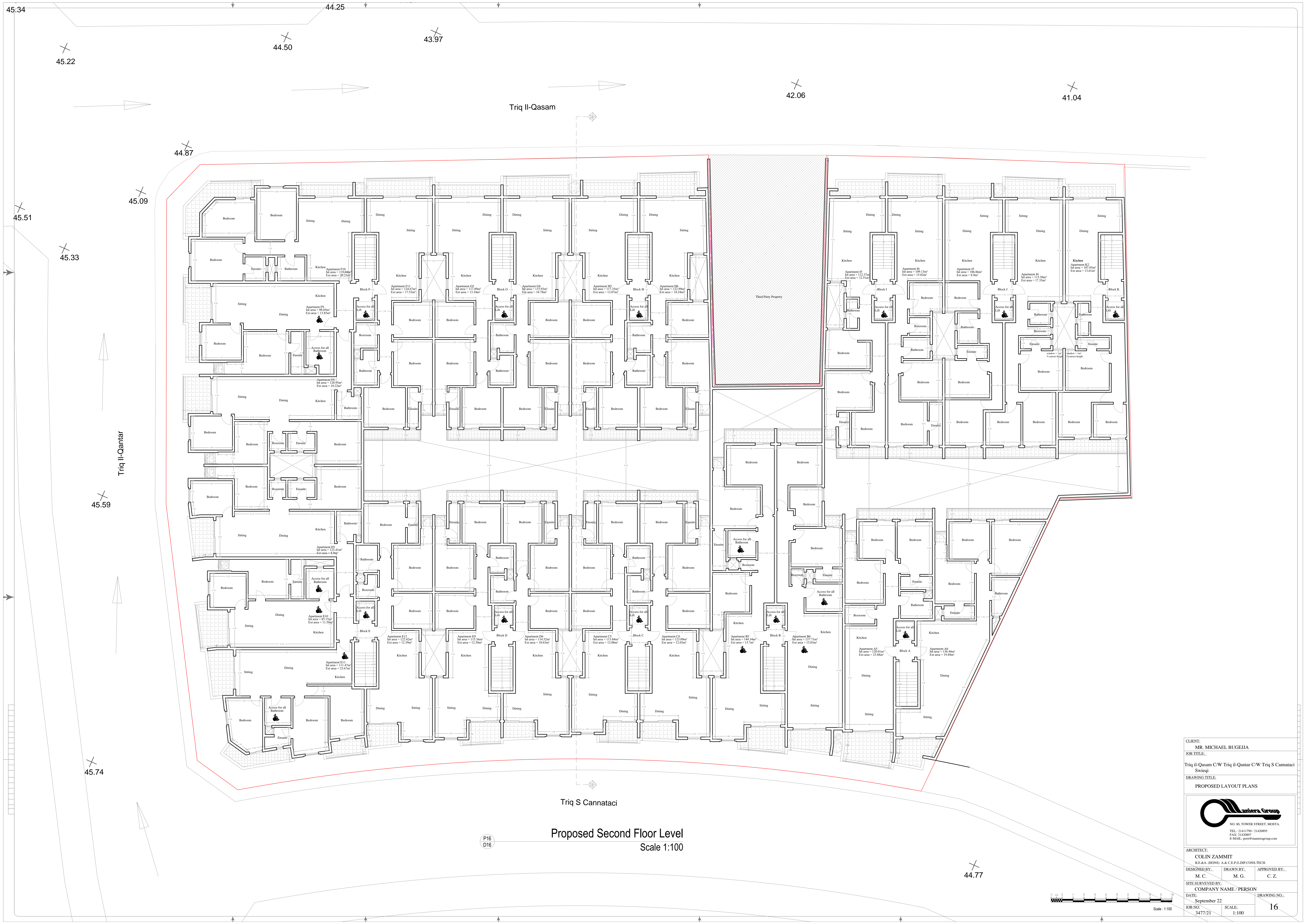
Proposed Second Floor Level Scale 1:100